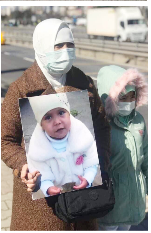
On March 8, Uyghur women marched to Ankara from Istanbul on International Women's day to raise their voice for their missing family members in China's concentration camps;