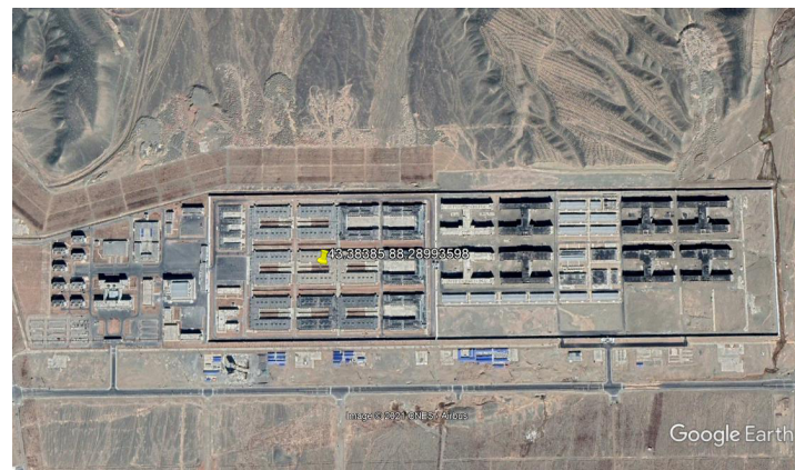
19 March 2020 (image available on Google Earth)

64. OHCHR examined a cross-sample of available judicial decisions in cases alleging terrorism or “extremism” with respect to defendants from ethnic communities in XUAR in the period 2014-2019. The number of publicly available and relevant court decisions is limited and may not necessarily be representative of the totality of judicial practice, but those that are available provide important insights into the way the judiciary has interpreted acts of religious “extremism”. 150 These include relatively minor infractions apparently punished severely; judgments referring to conduct being “extremist” despite none of the formal charges being related to terrorism or “extremism”; courts labelling acts as “extremist” without explaining how they fulfilled the applicable legal definition(s); the apparent targeting of underlying religious behaviour rather than the actual act for which the person is being prosecuted; and indications of an approach that considers any type of violation of law committed by a Muslim person as presumptively “extremist”.