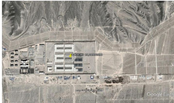
22 April 2018 (image available on Google Earth)