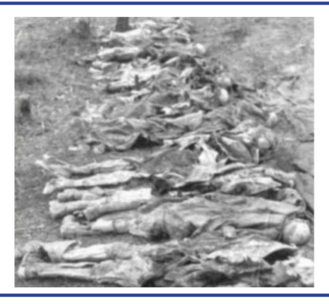
Bodies of victims of the Shadian massacre of 1975. Credits.