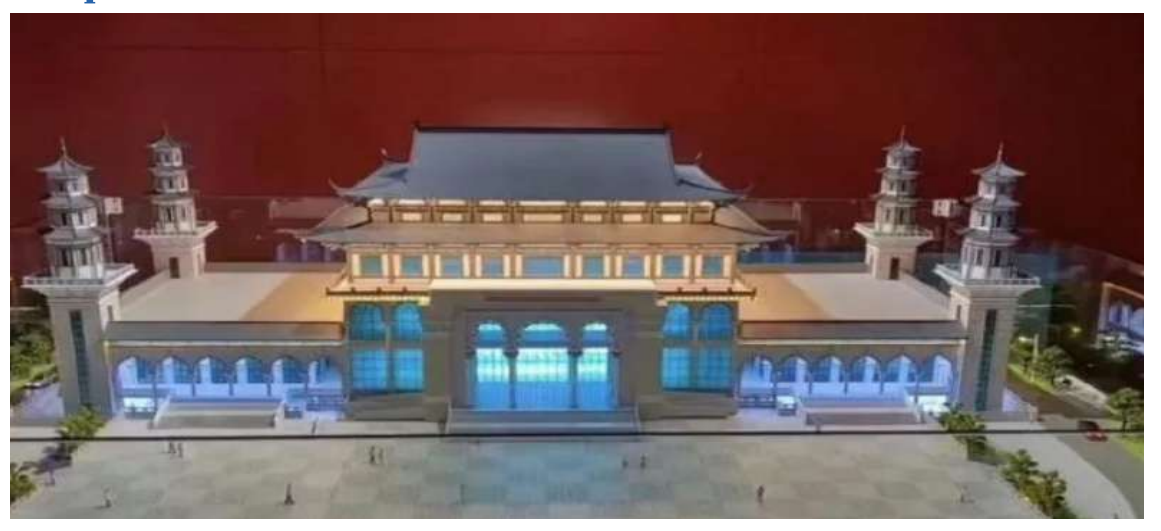
The model of the "renovated" mosque posted by the authorities on Weibo.