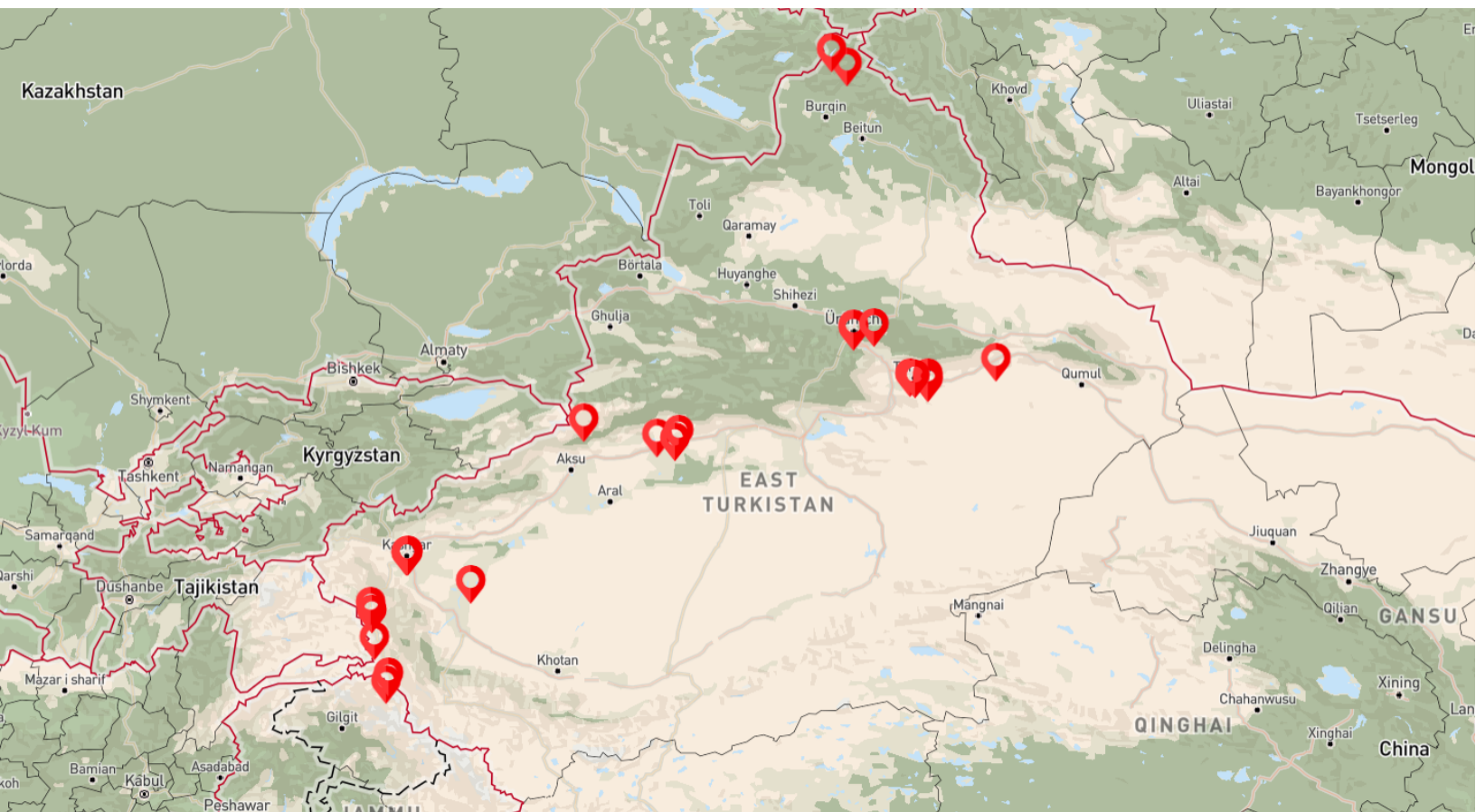
Map of tourist sites on itineraries of European travel companies listed in the current briefing.

tours to East Turkistan. While this survey may not encompass the entirety of the tours available in these countries, it does demonstrate the accessibility of such tours, suggesting that the 18 identified companies might only be the tip of the iceberg.